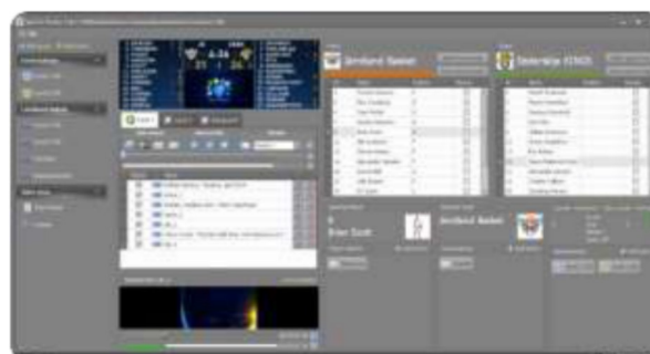
Sport In The Box Interface