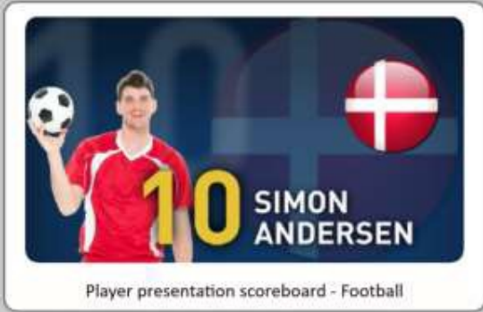
Player presentation scoreboard - Football