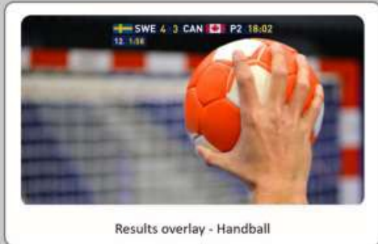
Results overlay - Handball