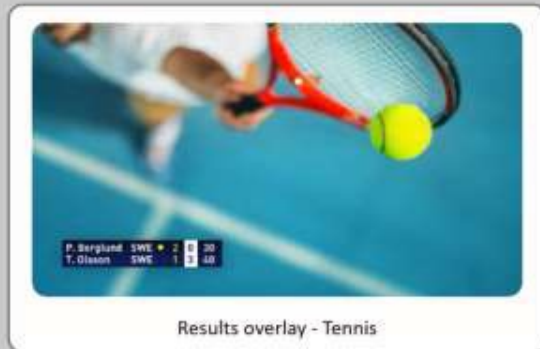
Results overlay - Tennis