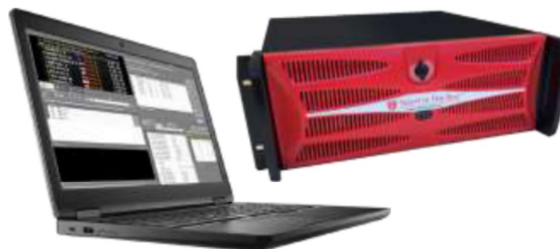
Sport In The Box Laptop & Rack Mount Computer