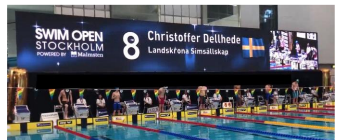
Custom Graphics for swimming event (25x3m Video Wall with 5200x624 pixels)

For example a wide video wall with live video and scoreboard, during lane presentations it can be configured to fill the whole screen and then go back to show scoreboard and live video during the race.