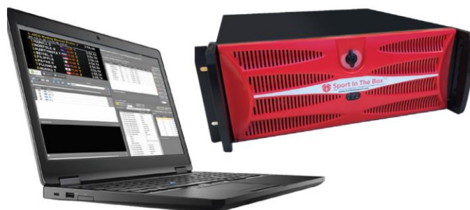
Sport In The Box Laptop & Rack Mount Computer