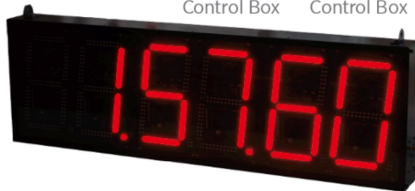
230 Series 6 digit scoreboard